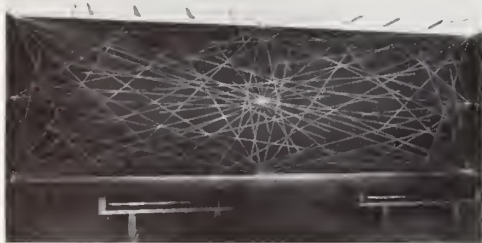
Sol LeWitt, Lines to Points on a Grid , 1976

In Minimalism, life and art were compartmentalized. Artists might take strong, even radical, political positions in their personal lives, yet their art reflected a realm of ideal and depersonalized forms and ideas. It was a realm where, for example, Sol LeWitt's wall drawings were executed by his associates or others, and seldom by the artist himself. The works' permanent existence was only in the form of typewritten documents which described the specific components and contained instructions for realizations—which were always temporary, the drawings being painted over when the exhibitions came to an end. For Donald